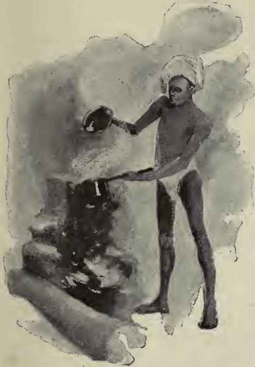
A YOUNG HOPEFUL

a patriarchal feeling which was agreeable, and that the 'mate' only got half pay! And every horse and cow, every elephant and